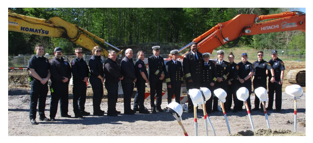
Norfolk town officials at the groundbreaking ceremony of the new fire station site on May 6.