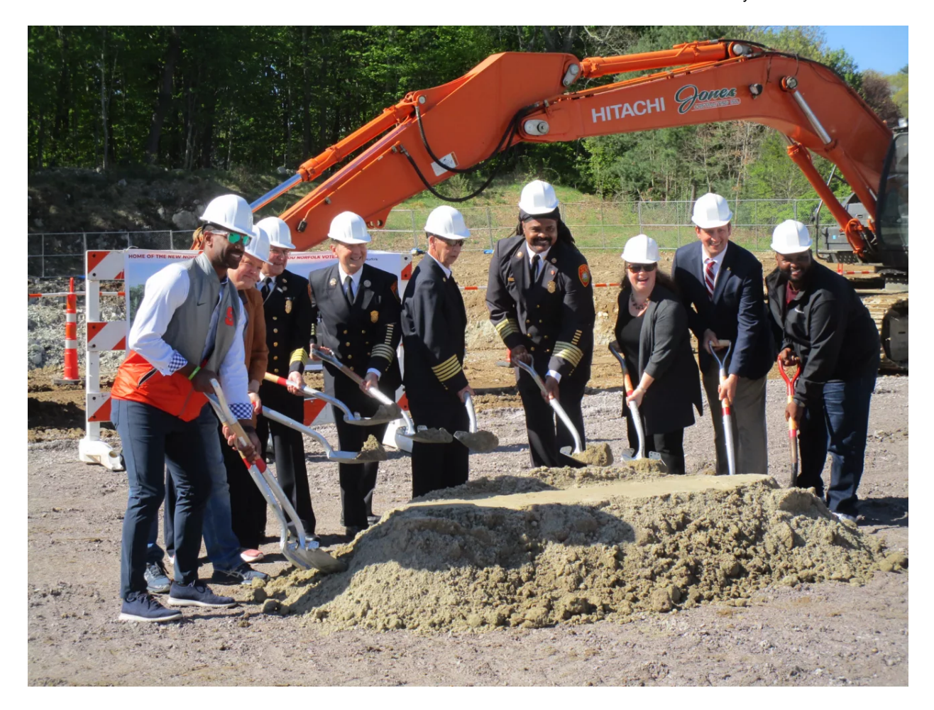
Norfolk town officials break ground at the new fire station facility site on May 6.